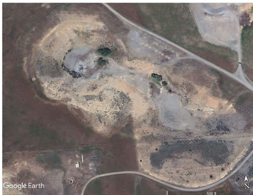
Figure 2: L&C Livestock Quarry- Aerial Image showing existing site conditions (5/20/2023)

As the permit has not been used for purpose approved for more than a year since mining commenced, the permit automatically terminated and to formalize the termination of the Use Permit, staff believe it is appropriate for the corresponding use permit to be revoked in accordance with Siskiyou County Code Section 10-6.1402.